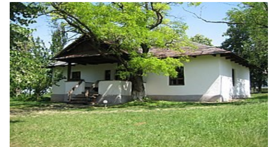
Memorial House Mihai Eminescu