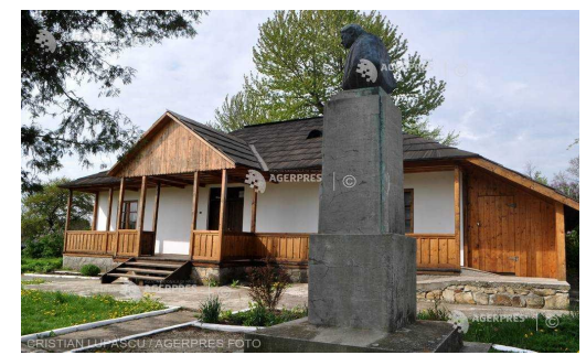
Memorial House George Enescu