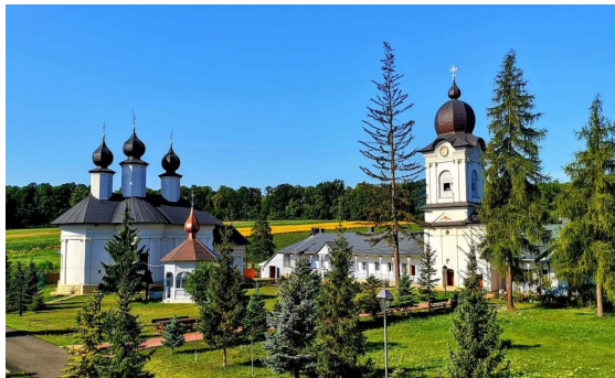
Monastery de Vorona