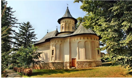
Monastery de Cosula