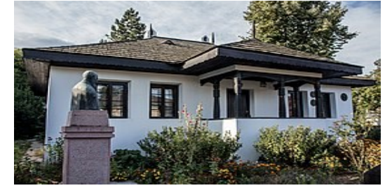
Memorial House Nicolae Iorga