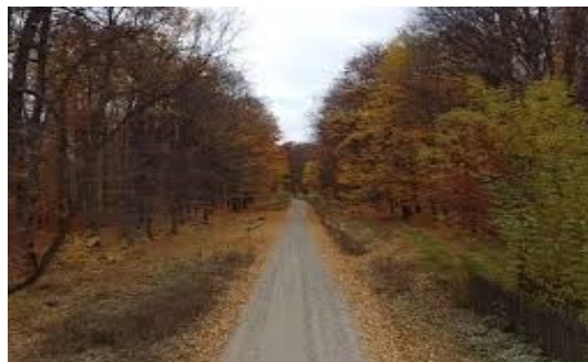
The nature reserve Fagetul secular Stuhoasa