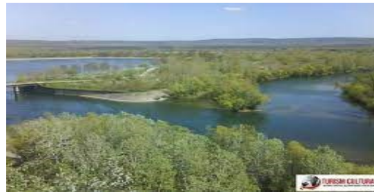
The nature reserve Stanca Ripiceni