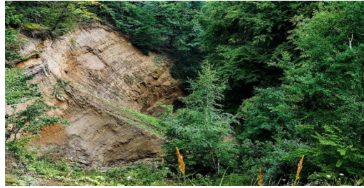
The nature reserve Padurea Tudora